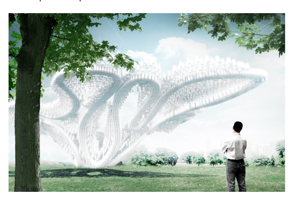
High-resolution renderings of the Governor's Cup design are available here: Outside view / Top view / Side view

FIGMENT, the Emerging New York Architect Committee (ENYA) of the American Institute of Architects New York Chapter (AIANY), and the Structural Engineers Association of New York (SEAONY) are pleased to announce that their competition jury has selected CDR Studio's Governor's Cup as the winner of the fourth annual City of Dreams Pavilion Competition. Pending permits and approvals, Governor's Cup will be assembled on Governors Island this spring, and will be open to the public for the summer 2014 season.